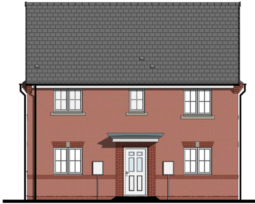
L.H. SIDE ELEVATION.